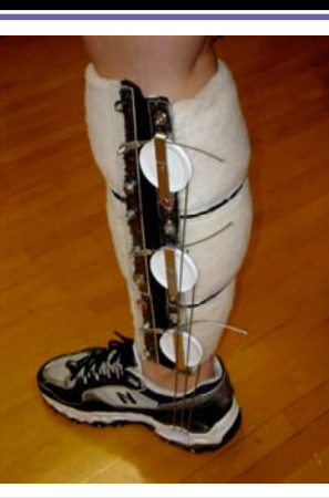
Fig. 1: The GAVRD introduces sequential pressure into a portable device.